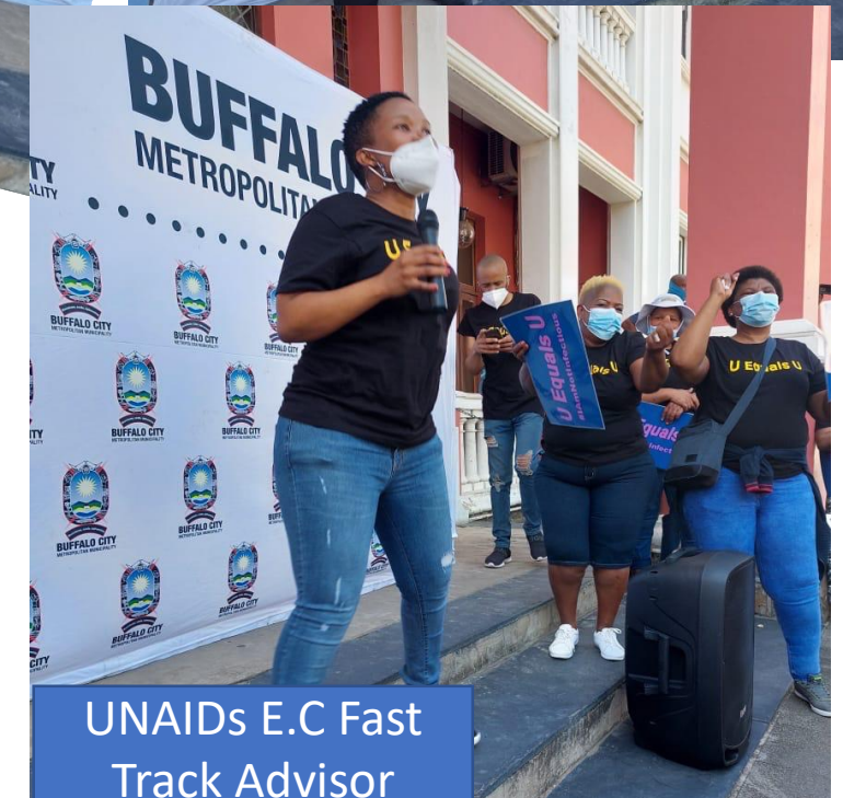
UNAIDS E.C Fast Track Advisor